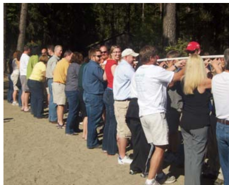
Adult class retreat at Lutherhaven 11 and 12 Sept.