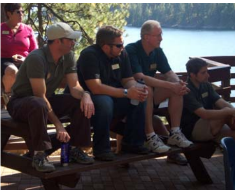
Adult Class of 2009 on their retreat at Camp Lutherhaven in Coeur d'Alene. (above, below)