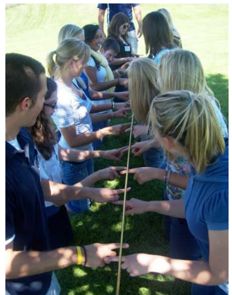
Youth Leadership Spokane Class of 2009 retreat at WSU Spokane (above)