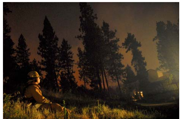
Firefighter Marty Shier (YLS 2007) rests as flames dwindle from the Dishman fire in southeast Spokane on 10 July.

24 September: "Share Our Dream" fundraiser hosted by Camp Fire USA , at the Davenport Hotel 5:00 – 7:00 PM. Wine and hors d'oeuvres will be served. To host a table, contact Ann at 747.6191 ext. 32 or amcalister@campfireinc.org .