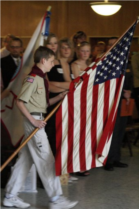
Members of Boy Scout Troop #325 presented the colors at graduation. (above)