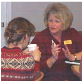
Education Day photos

she said to me, "I am so glad I met you, as I felt that no one had taken notice of me, you were the highlight of my day!" It felt really good to know that I had made someone feel valued. That's what being a leader is all about: having a positive influence on others. I would love to participate in another Habitat for Humanity event! The only thing I would change would be wearing warmer clothes during the cold months!